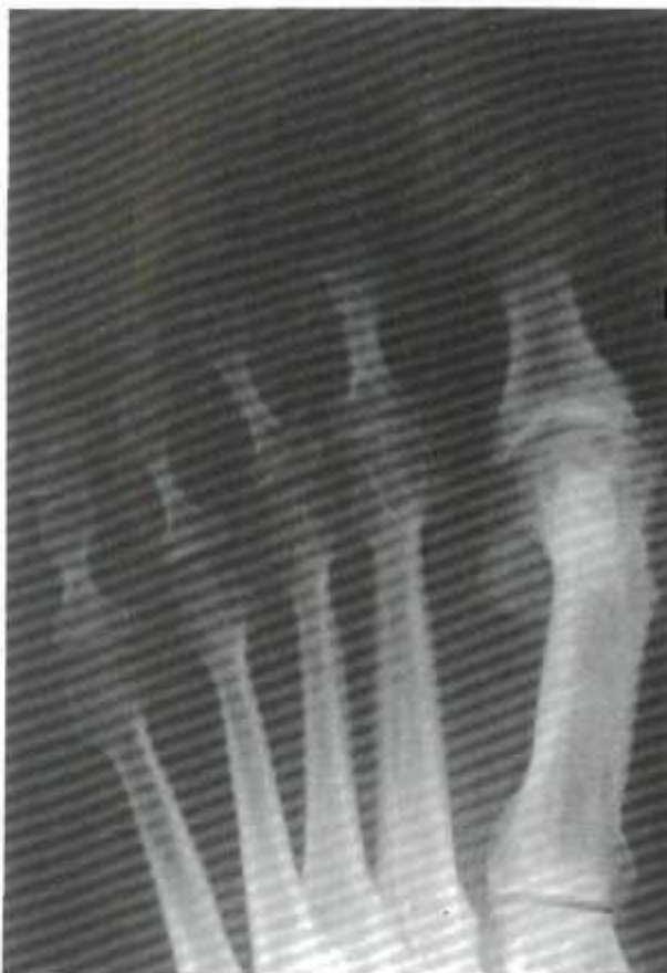
Fig. 1. Cystic changes noted in first metatarsal head following Chevron osteotomy.

Malunion of the distal first metatarsal osteotomy was observed at follow-up in two patients (three feet) (6%). In all three feet the distal fragment tilted into valgus angulation of 10^\circ to 35^\circ in relation to the proximal metatarsal shaft fragment (Fig. 2). One additional patient (one foot) lost fixation of the distal metatarsal fragment at 2 weeks postoperatively when the fixation pin was removed. A closed reduction was performed and the osteotomy healed in proper alignment with a satisfactory clinical result. One of the patients (one foot) with a malunion and the one patient that required a closed reduction of the osteotomy at 2 weeks had a