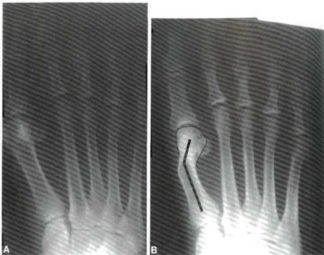
Fig. 2. A, Preoperative anteroposterior radiograph of Chevron osteotomy. B, Postoperative anteroposterior radiograph demonstrating valgus malunion of Chevron osteotomy. This patient also had a lateral capsule and adductor release.

and marginal osteophytes in one foot, but was totally satisfied with her result and had good toe range of motion with dorsiflexion of 30° and plantarflexion of 15°.